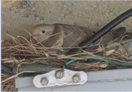
Mama and Papa Dove built their nest under the eaves of the church, right outside the office door!

In case you're not on Facebook, here are some photos that we posted recently.