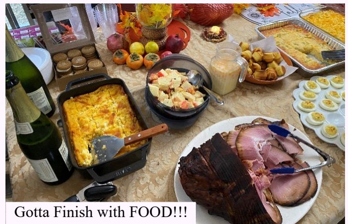
Gotta Finish with FOOD!!!