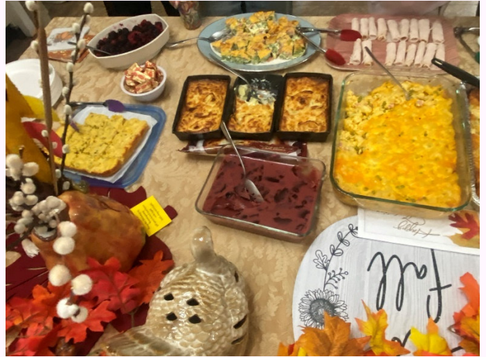
I learned one thing upon arrival at SMUMC – Methodists do good food good!