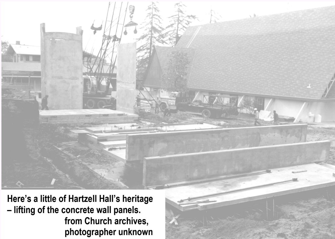
Here's a little of Hartzell Hall's heritage – lifting of the concrete wall panels.

SUNDAY, SEPTEMBER 9 th HARTZELL FELLOWSHIP HALL